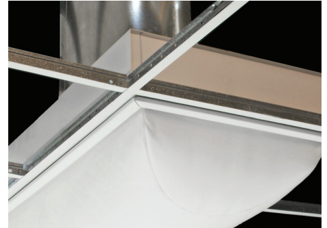
Close frame to secure textile air dispersion panel.