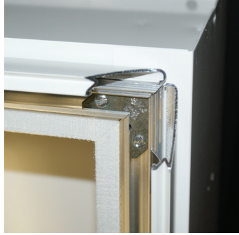
Open snap frame.