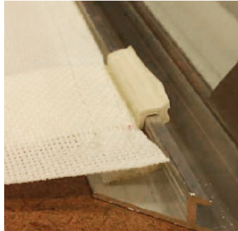
Affix grips to frame.