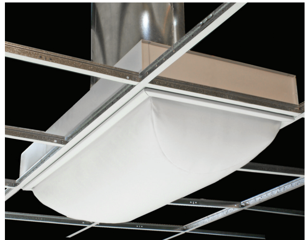
Above image reveals standard 24x48 backpan assembly installed in ceiling grid, ducted to supply and textile panel.

Connect diffuser to supply ductwork. Secure and seal per industry standard methods to prevent leakage.