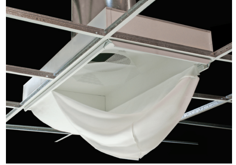
Secure textile air dispersion panel using hook/loop connectors.